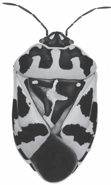
Harlequin bug (Pentatomidae). Deformed scutellum, and patches not symmetrical. Found near the Three Mile Island plant.

in 1994. This was the second scare in less than a year to hit the plant. According to the Daily Mail , a Dounreay spokesman “confirmed that eight workers were being tested for suspected plutonium intake”. The lab was already shut down the previous year “following a similar alarm involving 15 workers... In August, UKAEA started refresher courses following a number of radiation scares, during which contamination was detected on five workers in a week.” In February this year, the waste reprocessing complex was fined all of £140,000 for illegally releasing radioactive waste into the sea for more than 20 years. Radioactive particles from the plant will pollute beaches for decades to come and the environment will never be completely cleaned up, according to one expert study.