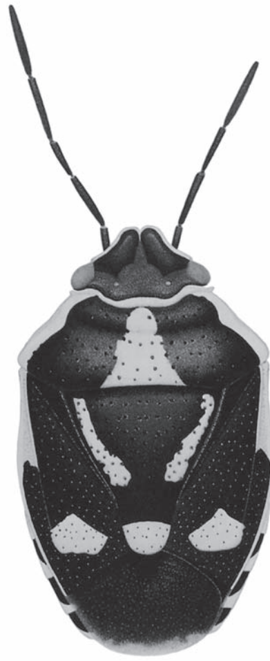
Vegetable bug (Eurydema oleraceum). Section missing from right feeler. Found in Rohr.